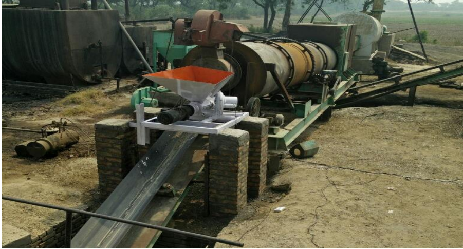
Asphalt plant/equipment for utilizing waste plastics in road construction