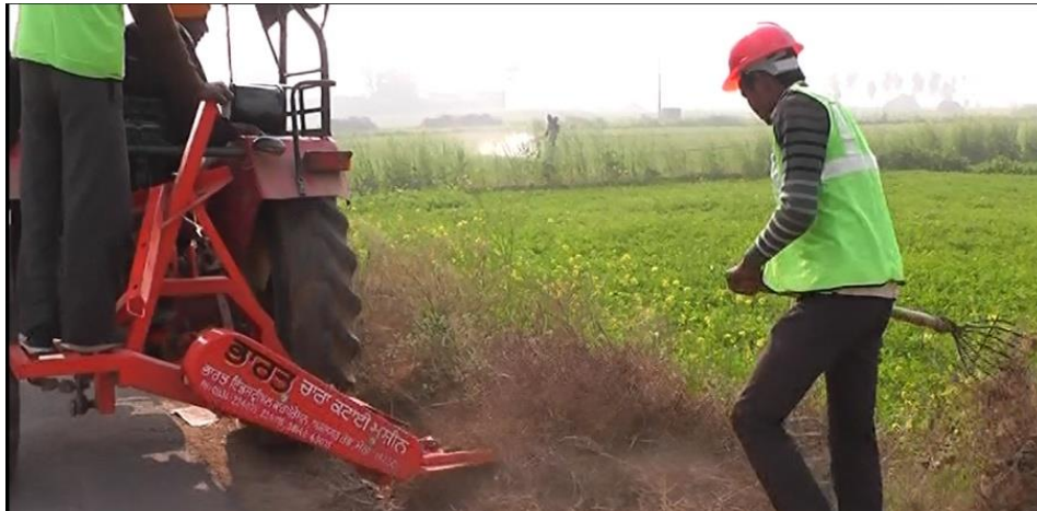
Contraption devised for cutting/trimming of shoulder vegetation