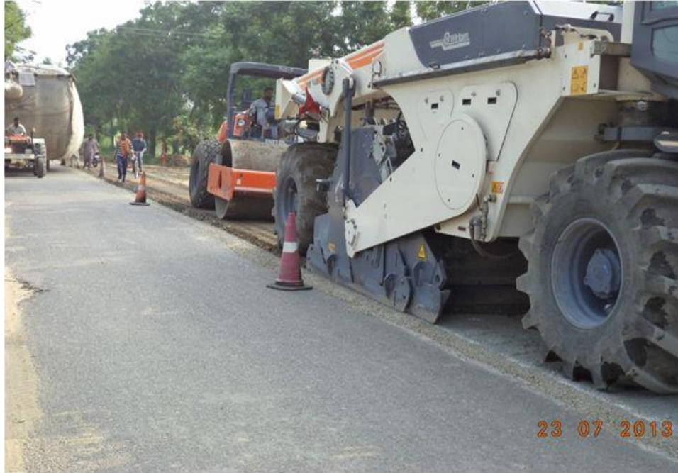
Cold-in-place recycling of bituminous pavement being piloted on OPRC Network