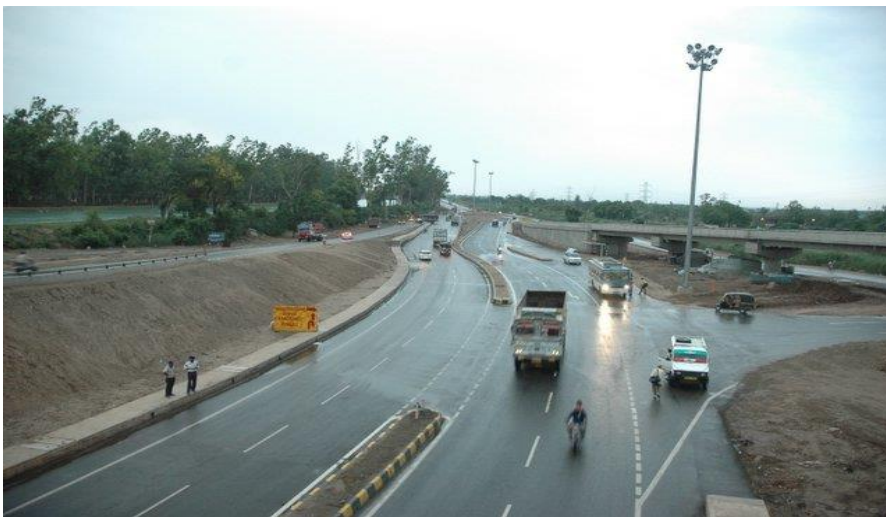
Kiratpur-Kurali National Highway