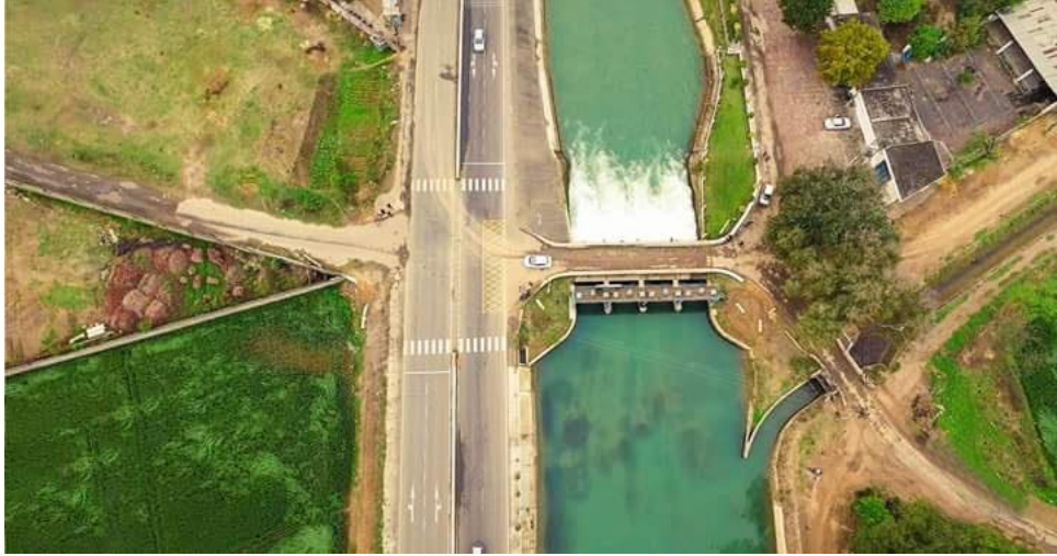
Southern Bye Pass, Ludhiana