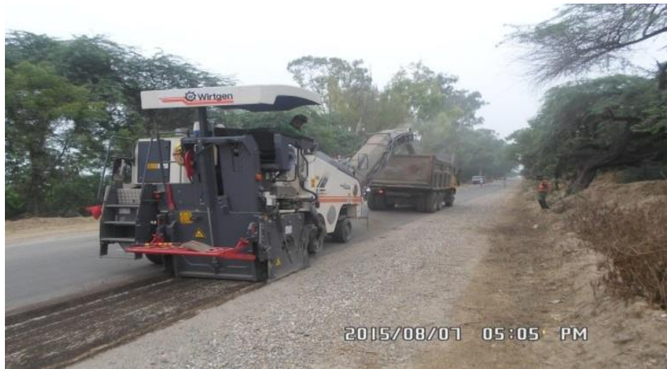
Milling of old bituminous surface in progress on OPRC Network