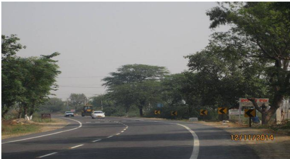
Upgradation of SH-12A