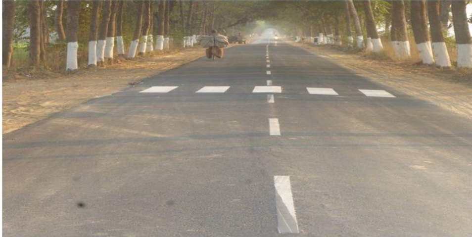
State Road upgraded under OPRC