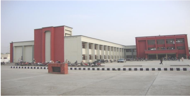
Consumer Dispute Redressal Commission