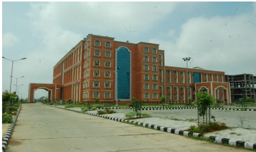
Judicial Court Complex, Kapurthala